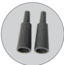
Test probe covers for CAT IV 600V