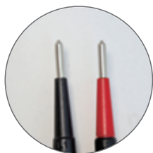
4mm Screw on Test Probes for more robust application