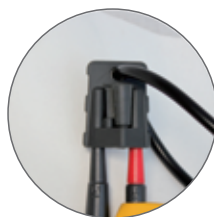
Test Probe cover and accessories holder