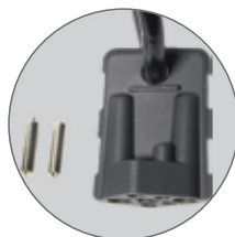
Screw in Test probes and Test Probe cover