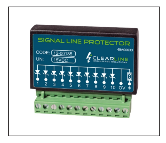
*Specifications subject to change without prior notice due to continuous improvements