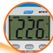
2000 Count LCD Display