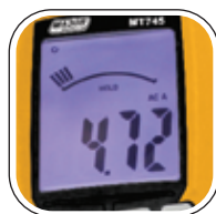
3000 Counts Backlit LCD