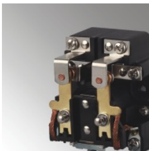
JQX-62 2Z 80A