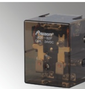
JQX-62F 2Z 80A