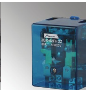
JQX-62FH 2Z 80A