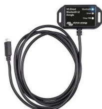
VE.Direct Bluetooth Smart dongle (must be ordered separately)

An excessively high or low battery voltage is indicated by an audible and visual alarm, and a relay for remote signalling.