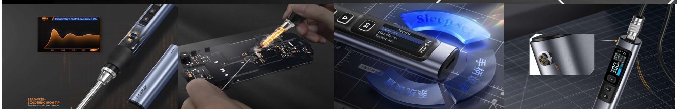
Accuracy < 2%