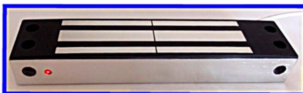
POWER LED OPTION

A range of mounting brackets are available to suit most installation requirements.