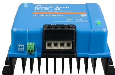
Orion-Tr Smart 12/12-30