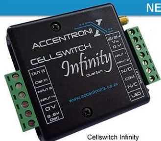
Cellswitch Infinity Size 76 x 66 x 28 mm