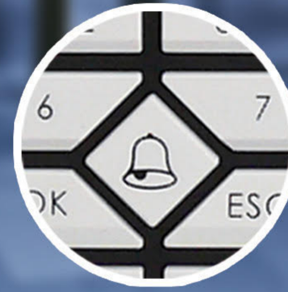
Wired door bell