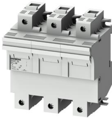
SETRON, cylindrical fuse holder, 22x58 mm, 3-pole, In: 100 A, Un AC: 690 V, LED signal detector