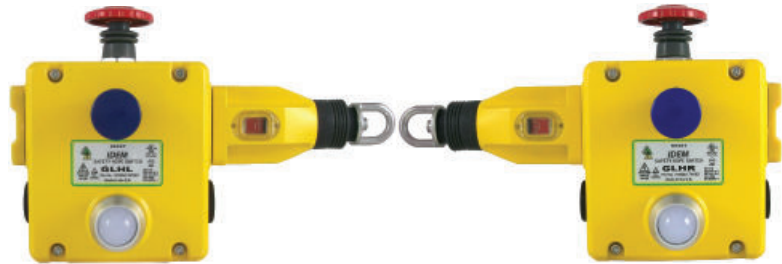
GLHL (Left Hand)