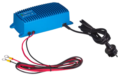
Blue Smart IP67 Charger 12/25