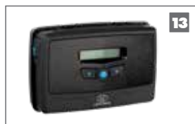
G-SPEAK ULTRA Answer your intercom from anywhere for maximum security and convenience - powered by 4G technology