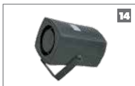
12V-24V SMART Siren The ultimate security companion, designed to seamlessly integrate with your existing SMART gate and garage door operators (not shown in diagram)