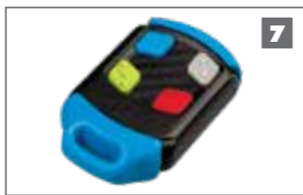
CENTURION Transmitters Available in one-, two- and four-button variants. Incorporates code-hopping encryption