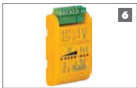
FLUX SA Loop Detector Allows free-exit of vehicles from the property - requires ground loop to be fitted