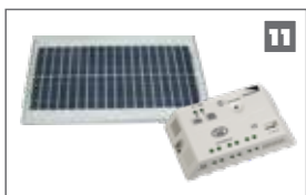
Solar Supply Solution Alternative means of powering the system - consult your CENTURION dealer