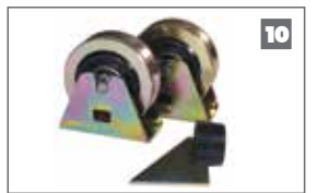
Wheel Kits A variety of wheel kits are available from your CENTURION dealer