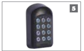
SMARTGUARD or SMARTGUARDair Keypad Cost-effective and versatile wired and wireless keypad, allowing access to users with a customised code