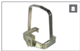
Theft-Deterrent Cage & Padlock Patented design provides excellent deterrence against theft, tampering and vandalism