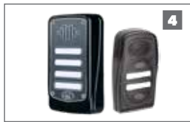
Gate Stations Communication hub for the G-SPEAK ULTRA GSM intercom – available in both durable plastic and stylish and strong metal enclosures