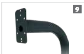
Gooseneck Steel pole for mounting intercom gate station or access control reader