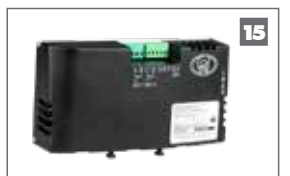
SMART PowerPack Power unwavering gate performance for busy sites. Run your gate directly from mains. Optional battery backup for added flexibility