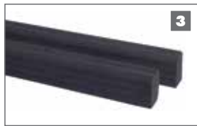
P36 Passive sensitive edge provides additional protection against crushing