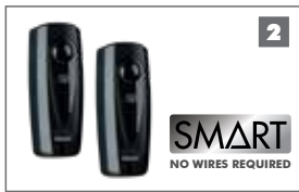
Photon SMART Safety Beams Fully-wireless infrared beams. Always recommended on any SMART automated installation