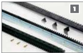
Steel, Nylon RAZ or Nylon Angle Rack A variety of rack available in different lengths, for different strengths