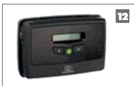
G-ULTRA The ultimate GSM solution for monitoring and activating the operator via your mobile phone