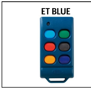
Compatible with both the ET Blue and ET BLU MIX ranges of remotes

(NB. The ET BLU MIX remote button must be set to the old ET Blue code for use on this motor)