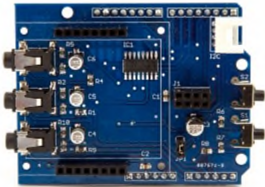
EM Shield V1

Energy Monitor Shield is an Arduino-compatible expansion card designed for building energy monitoring system with LCD screen and an interface for connecting the wireless transceiver nRF24L01 +.