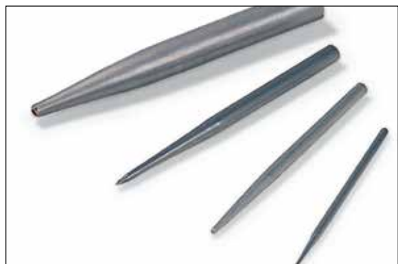
TJC applicator tools.