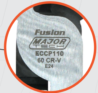
60CRV Chrome Vanadium Steel