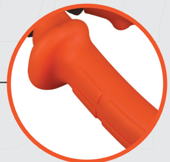
TPE Rubber 1000V Insulated Fusion Grip