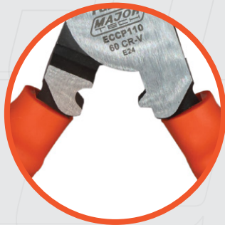
Terminal Crimping Slot