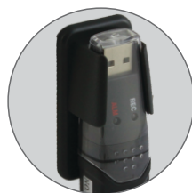
Wall Mounting Clip