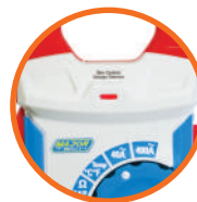
Red Light indicates detection of Non Contact Voltage (NCV)