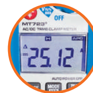
4000 Count Backlit LCD Display