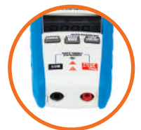
Rear entry of standard 4mm Test Lead Terminals