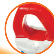
Meter includes flash light to light up area of test