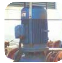
Full visible light

National Telephone Number: 08 61 62 5678