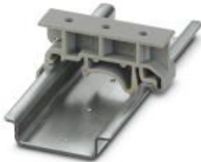
Rail adapters, for M3 screws, length: 42.6 mm, width: 10 mm, height: 19 mm, color: gray

Please be informed that the data shown in this PDF Document is generated from our Online Catalog. Please find the complete data in the user's documentation. Our General Terms of Use for Downloads are valid ( http://phoenixcontact.com/download )