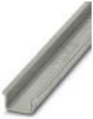
DIN rail, unperforated, Standard profile 2.3 mm, width: 35 mm, height: 15 mm, acc. to EN 60715, material: Steel, galvanized, passivated with a thick layer, length: 2000 mm, color: silver

DIN rail, unperforated - NS 35/15-2,3 UNPERF 2000MM - 1201798