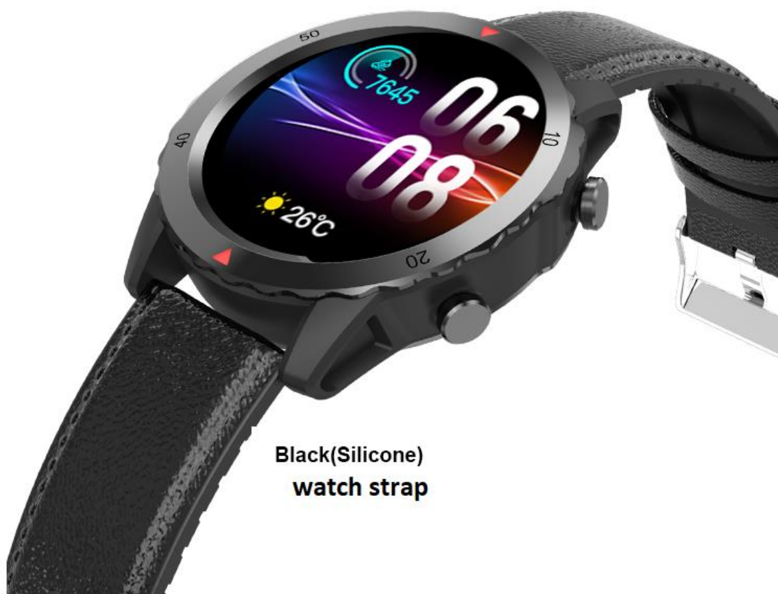
Black(Silicone) watch strap

Full touch, Full screen, Two physical button