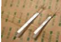
CONNECTION: SOLDERING RIBBON