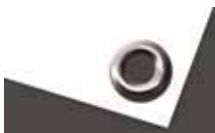
FIXING: STAINLESS STEEL EYELETS