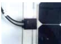
CONNECTION: JUNCTION BOX