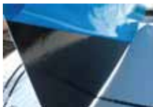
FIXING: DOUBLE SIDED TAPE