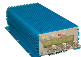
Orion IP67 24/12-100 Orion IP67 12/24-50