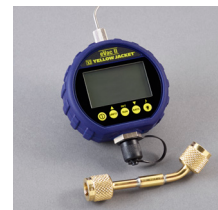
69050 Protective Gauge Boot