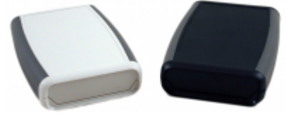
Light Grey or Black Enclosure Color