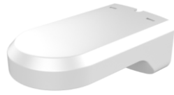
DS-1294ZJ Wall Mount